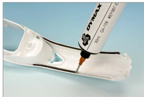
Dispensing a soft gasket into the groove of an appliance device to reduce vibration and create a water-tight seal.