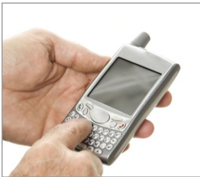
Components of portable electronic devices can be sealed, bonded, laminated, coated, and otherwise protected through the use of light-curable materials.