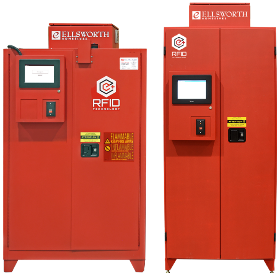
Flammable RFID Cabinet